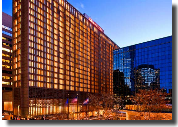
Sheraton Denver Downtown Hotel

galleries/districts, theater, music, and splendid examples of Victorian and ultra modern architecture are located just outside the hotel. A program of 220+ sessions, a four-day film festival and a bustling book bazaar await attendees. The American Anthropological Association will hold its annual meeting at the Denver Convention Center November 18-22, slightly overlapping with MESA. A joint session will take place at the AAA venue on Sunday, November 22 (see page 12 for details).